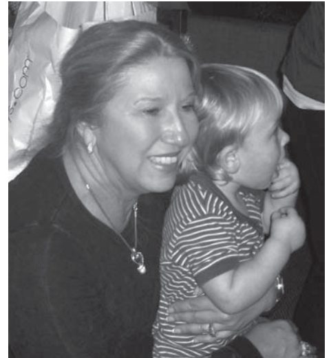
The kids love Wendy!

Beyond our daily needs are bigger items that would greatly enhance our programs. If you can help, please contact us at 805-240-1644. Thank you!