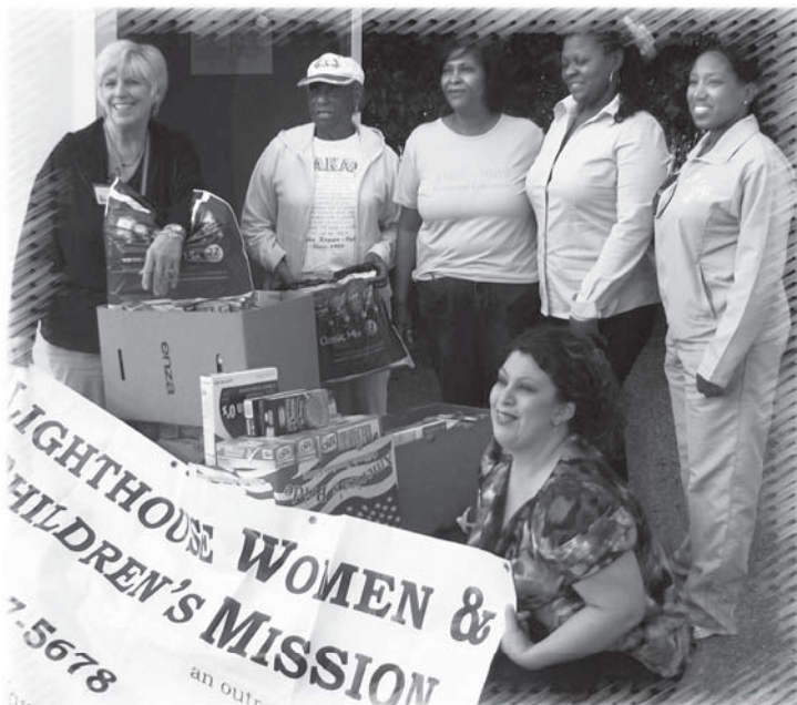
Alpha Kappa Alpha helping with a food drive on Martin Luther King day.

And they certainly aren't the only sorority that loves and supports the Lighthouse! Alpha Kappa Alpha supports us annually as well. Women who want to give back and choose to give back to our women and children are vital to all we do!